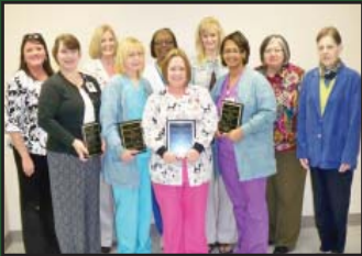
Crossroads Customer Appreciation Awards